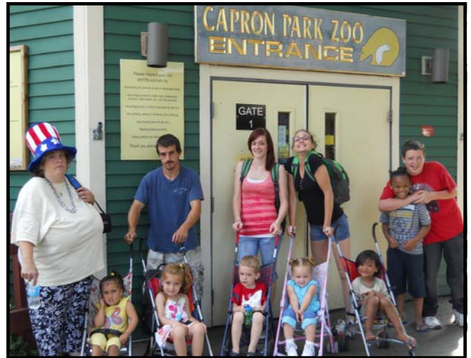
Ready to have fun... Taunton Family Center visiting Capron Park in Attleboro, which opened in 1937.

Capron has been undergoing renovations, which includes installation of a splash pad. In addition to seeing a variety of animals like a snow leopard and a white lion, families enjoyed picnicking in the playground area.