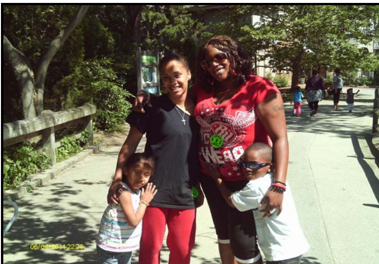
Ready to have fun... Fall River Family Center visited Roger Williams Park in RI in June. Residents enjoyed the outing, which was made possible through a United Way of Greater Fall River grant award.