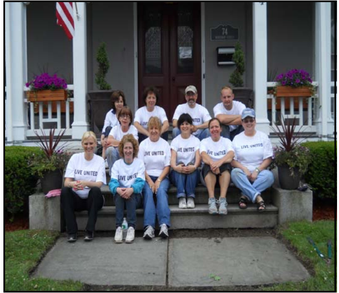
All decked out to work at Taunton Family Center

tremely hard, and the yard looks amazing. Staff and residents are grateful." Clean-up efforts included weeding beds around the house and adding mulch, planting 5 bushes along the parking lot, as well as removing overgrown front bushes and planting two new ones; and trimming bushes in the side yard.