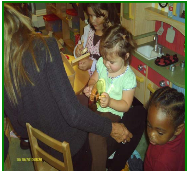
HORIZONS FOR HOMELESS CHILDREN... donated a new play space at the Fall River Family Center October 19. As can be seen in this photo, the children needed no encouragement to begin playing with their new toys.