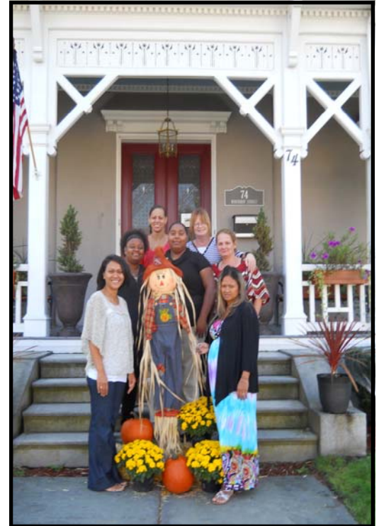
Taunton Family Center celebrated its one year anniversary September 3 in Taunton. Here staff gathers at the entryway.

Staff asks that food items be delivered no later than November 21st for Thanksgiving, and Christmas donations be delivered by December 19. This affords them time to distribute food and gifts to families in a timely manner.