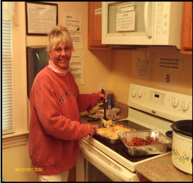
BREAKFAST OF CHAMPIONS... was served on April 23.

“The Community supporter of the Fall River Outreach Group” of Christ Family Center. Six families (six adults and eight children) sat down to a home-cooked breakfast. The church has been a long-time