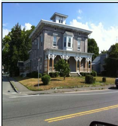
Taunton Family Center, housed in the oldest concrete dwelling in the country

Horizons for Homeless Children has play groups running at both the Fall River and Taunton shelters. Last week's play group included a sprinkler splash, which was a great hit with the kids.